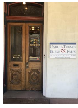
Come see us soon!