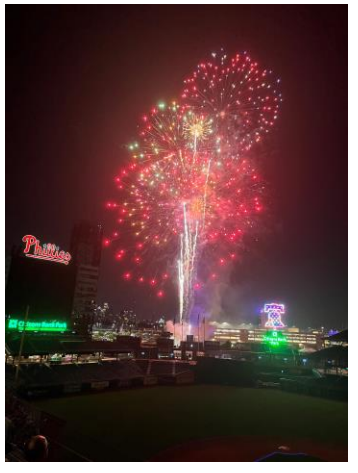
Phourth of July Phestivities at the Phillies!

PAGE 3 – Yeti Contest Winners And More Pics Like The One Below!